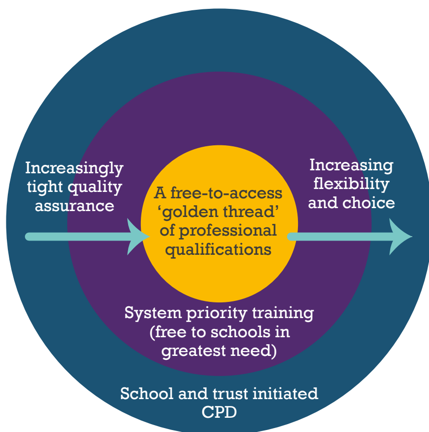
FIGURE 3.1: A PROFESSIONAL DEVELOPMENT ENTITLEMENT FOR ALL TEACHERS